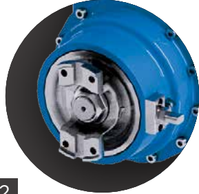
2 DIFFERENTIAL LOCK