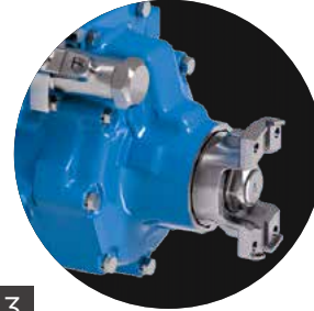
3 REAR AXLE DISCONNECT