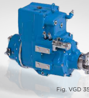
Fig. VGD 35