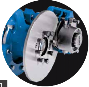
1 PARKING BRAKE